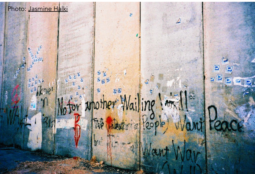
The Israeli West Bank barrier with the inscription, "Not another wailing wall," 2006.

In 2011, the people of Lake St. Martin were forced to evacuate their community after a flood, which was caused by a government