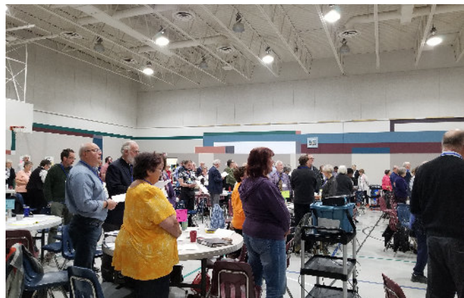
Worship and Gospel-based Discipleship at Diocesan Synod 2018.